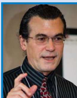
Dr. Eliseo Pérez-Stable

Redes En Acción is also working to develop a new program aiding Latino graduate students in the Southwestern United States enter doctoral programs.