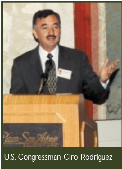
U.S. Congressman Ciro Rodriguez